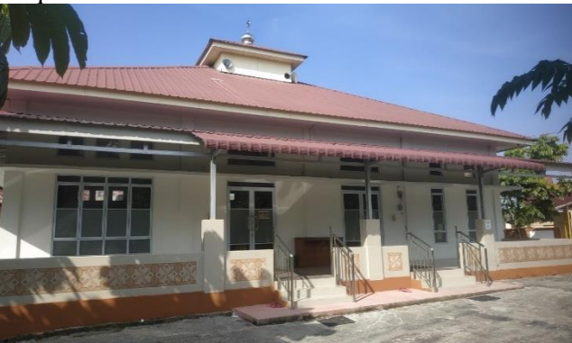
Figure 1. The front view of the Al-Hikmah mosque

The results of the implementation of activities at the AL-Hikmah mushalla are web applicationbased financial management socialization and training, providing structured, transparent and easyto-access reporting techniques.