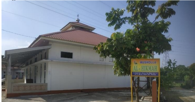
Figure 2. Side view of Al-Hikmah Mosque

The existence of the al-hikmah prayer room is very important, because it is located in the middle of a settlement of 300 households. As shown in picture 2. Al-Hikmah Mosque has been renovated several times. Which aims to provide more comfort and tamping power to pilgrims who will worship and carry out Islamic religious activities.